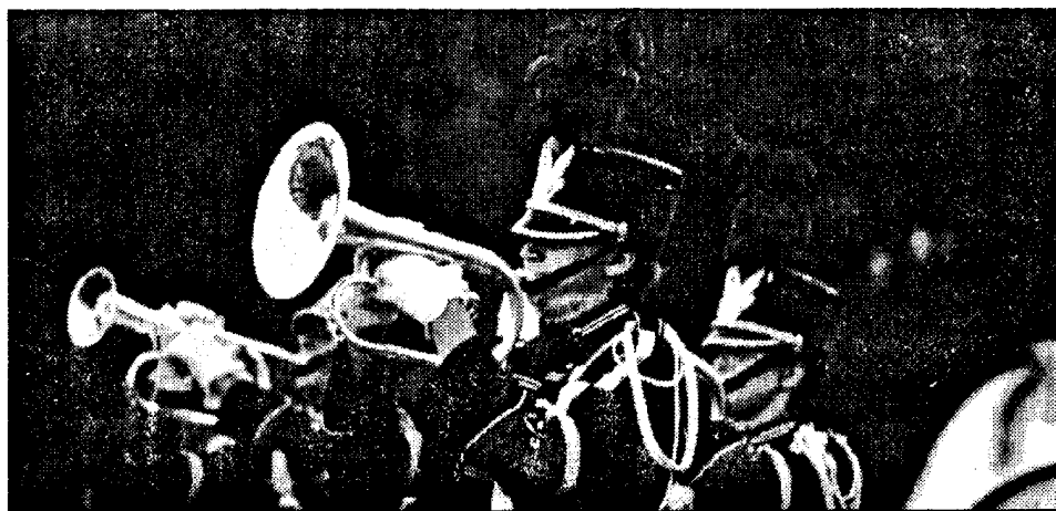
Audiences eagerly await the Boston Crusaders' traditional Conquest, and the Massachusetts corps didn't disappoint this year.

once again prove that drum corps can be fun for everyone in corps—members and audience alike. They were awarded an 87.00 for third place.